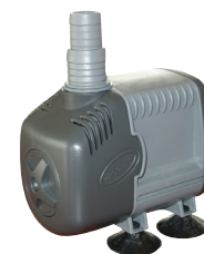
Syncra SILENT Pumps