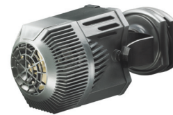
Voyager HP Pumps

I think you will find the above bullets give you a good reason to support Sicce, a brand that gets behind the independent stores that keep our hobby going.