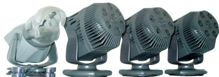
Voyager 1, 2, 3, 4 and HP Stream & Current Pumps