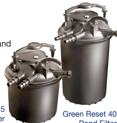
Green Reset 25 Pond Filter